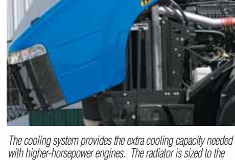
engine and can be accessed easily for cleaning.